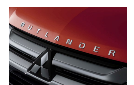
» BONNET BADGE