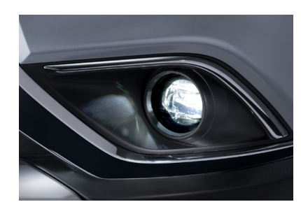
» FOG LAMPS