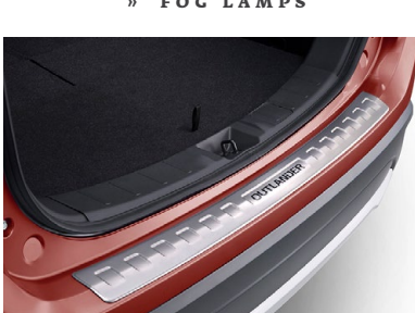
» REAR BUMPER SCUFF PLATE