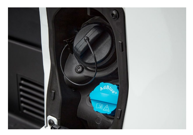
» MODEL SHOWN Express in White Solid with optional accessories.

» Adblue® is only available on the 2.0L Intercooled Turbo Diesel.