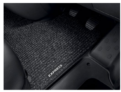
» CARPET MATS