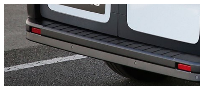
» BARN DOOR PROTECTOR