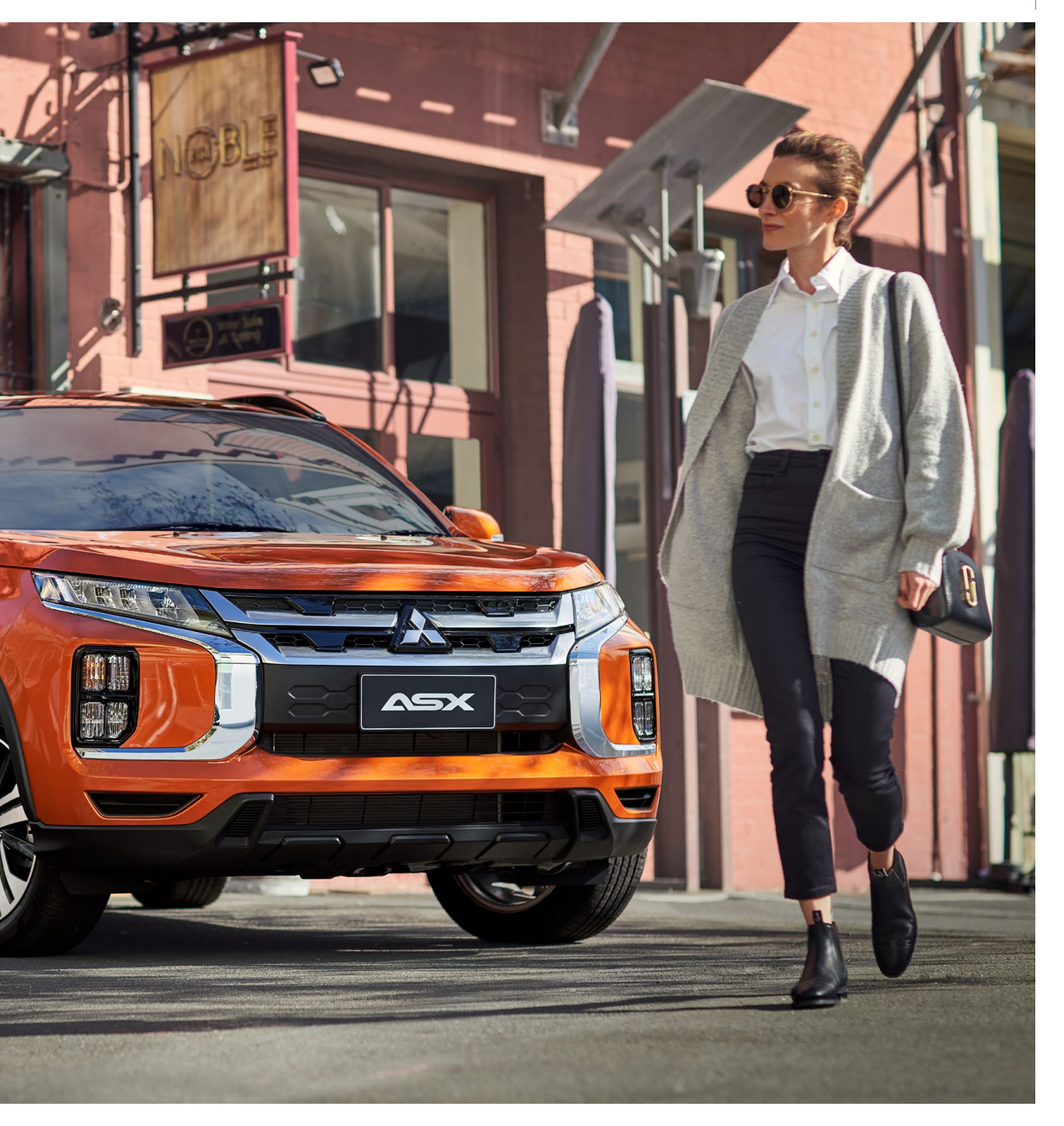
» MODEL SHOWN ASX VRX in Sunshine Orange