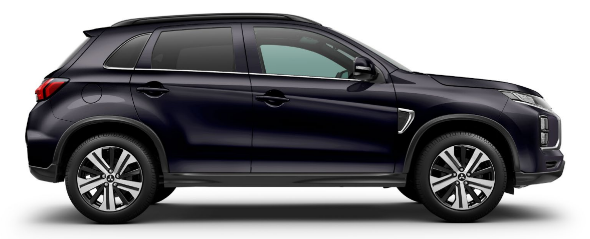
» ASX VRX in Amethyst Black