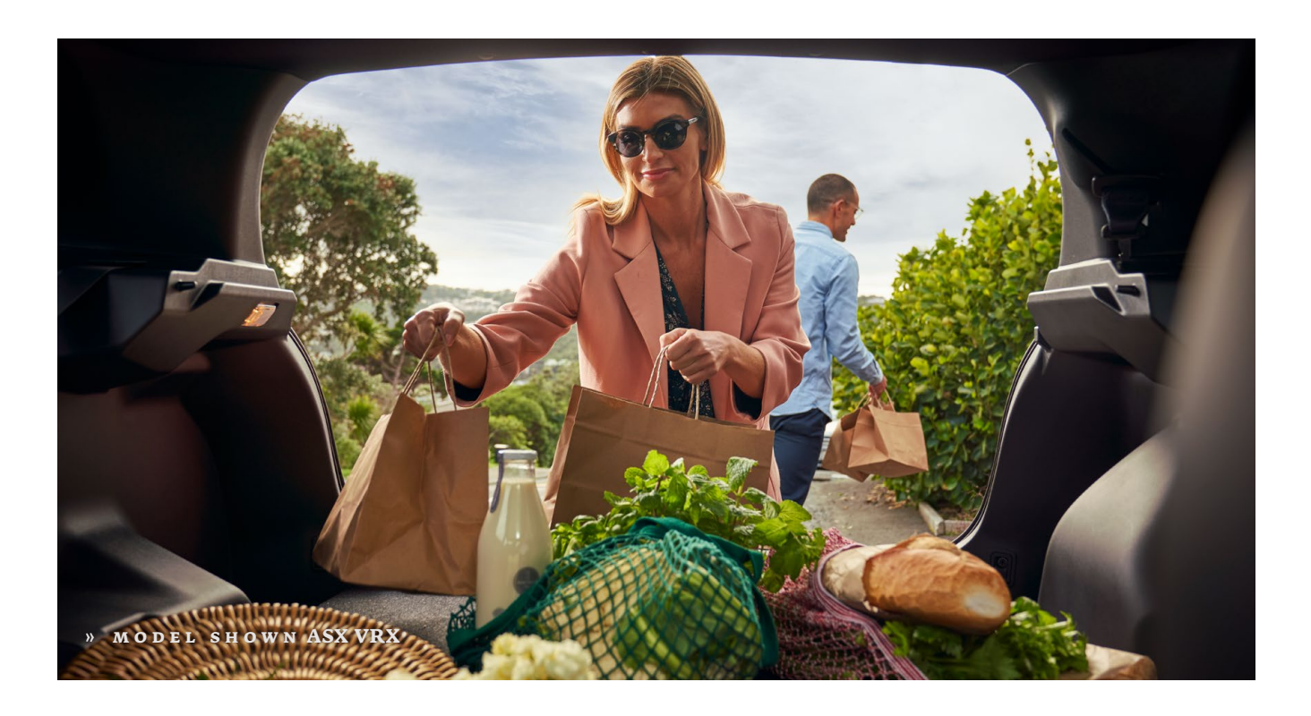
A VEHICLE LIKE ASX IS GOING TO LEAD A VERY BUSY LIFE. WHEREVER IT TAKES YOU, YOU'LL BE SURROUNDED WITH FEATURES THAT OFFER LUXURY, COMFORT AND CONVENIENCE IN EQUAL MEASURE.

Ease into the driver's seat. Let your hands close around the smooth leather steering wheel. From here you're in complete control of the vehicle and the array of features it has to offer. The power steering adjusts to your speed: firm and accurate on the open road; light and easy when you're in a car park, where you'll also appreciate the small turning circle.