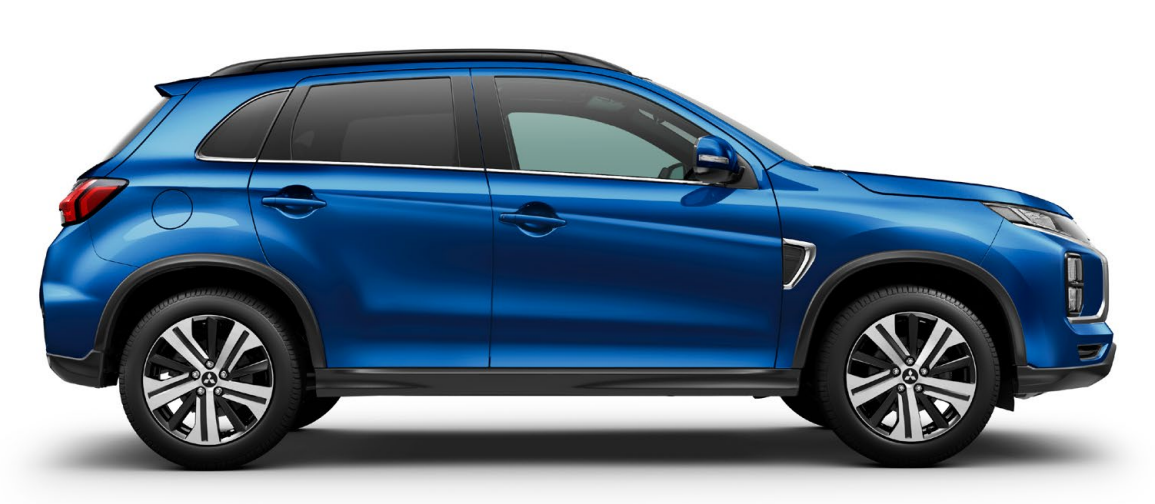
» ASX VRX in Electric Blue