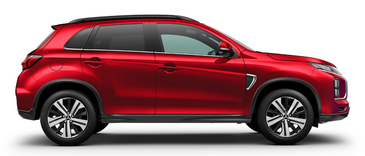
» ASX VRX in Red Diamond

MNZ 0007 ASX MY20 Brochure 5_0.indd 17 23/09/19 10:49 AM